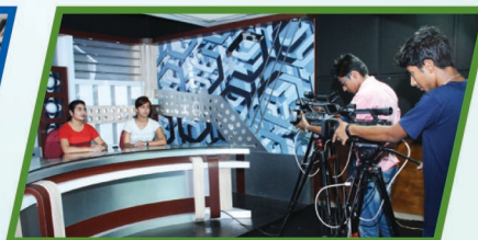
◆ Studio & News Lab