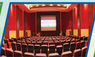
◆ Multiple Auditorium and Conference centers