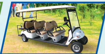
◆ Eco-Friendly Campus Transport