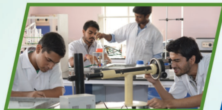
◆ State-of-the-art laboratories