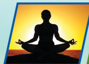
◆ Yoga & Meditation centres