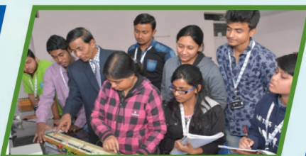
◆ Research & Innovation