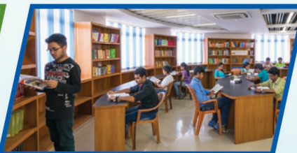
◆ Central and School wise Libraries