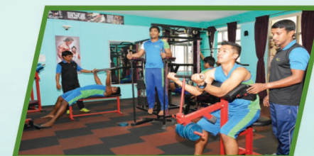
◆ Fitness Regime