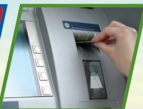
◆ Campus ATM and Bank

Recognised and enlisted by UGC as competent to award degrees under section 22 of UGC Act, 1956