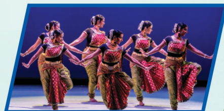
◆ Cultural CoE