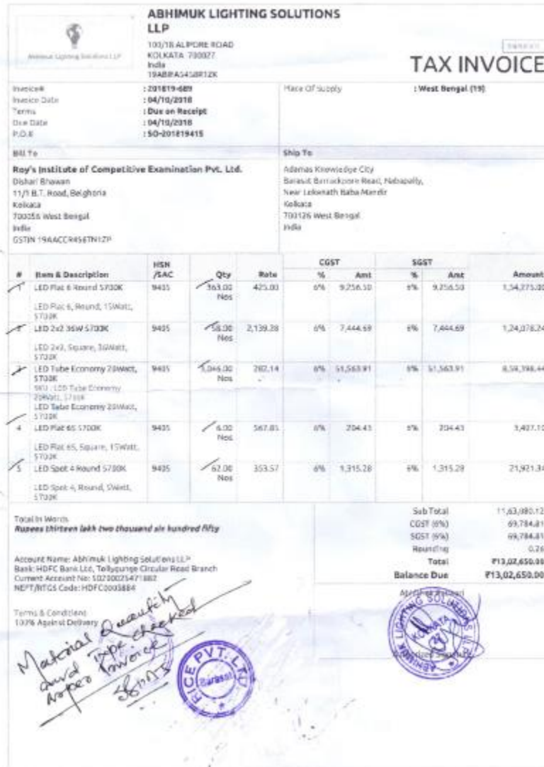
Figure 2: Tax Invoice of LED bulbs from Abhimukh Lighting